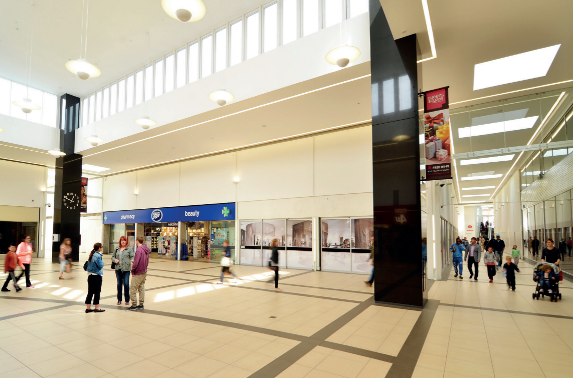
44 Brakel® Inova ventilation windows