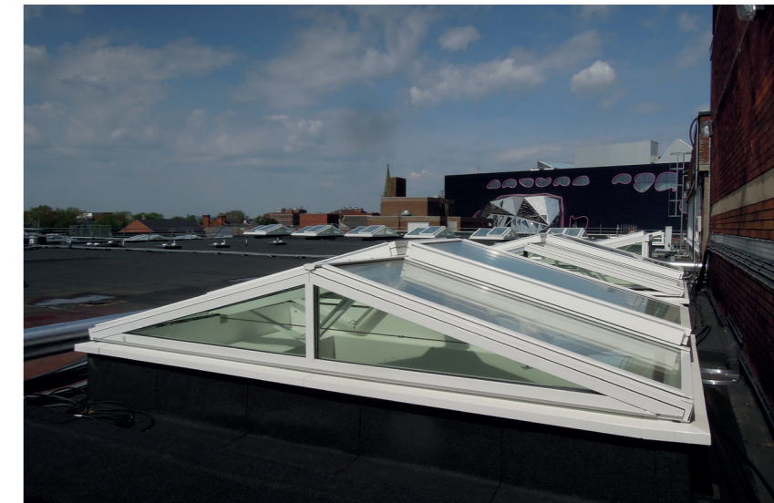
36 Brakel® Duralite rooflights

"Brakel Airvent met all requirements concerning natural ventilation, fire strategy and maintenance"